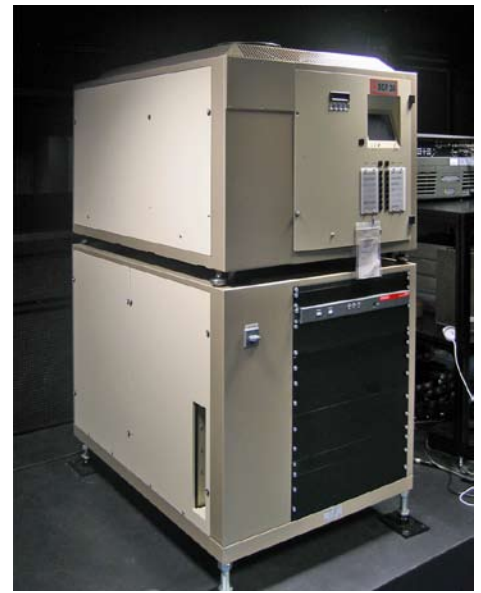
DCP 30 Digital Cinema Projector at the projection room

Amongst other purposes, the DCP projectors are used for the impartial evaluation of D-Cinema servers and are equally suitable for presenting alternative content.