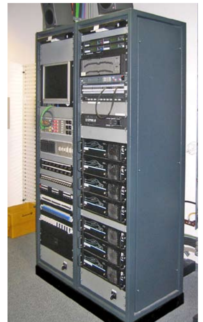
Audio and video racks with patch fields at the backstage area

The cinema sound system allows the feeding of "non-cinema" sources as well as of sounds from the in-house sound studio. For crosslinking and circuit-entering of the signals, an electronic cross bar and a freely configurable monitor management system was employed. Two freely programmable and remote-controlled four-channel equalizers take care of the room equalization of the sound system.