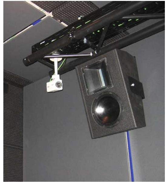
Video cameras transmit images from the auditorium

Special ceiling and wall panelling provides well-balanced room acoustics for optimum sound quality and speech intelligibility throughout the whole auditorium.