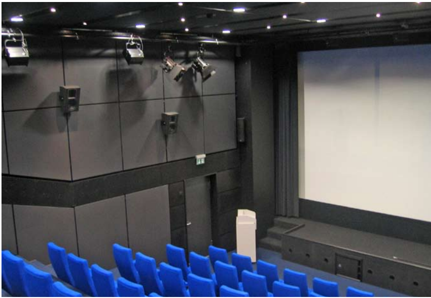
„Cinema of the Future“ at the Fraunhofer IIS: The technical equipment is clearly visible for presentation purposes.