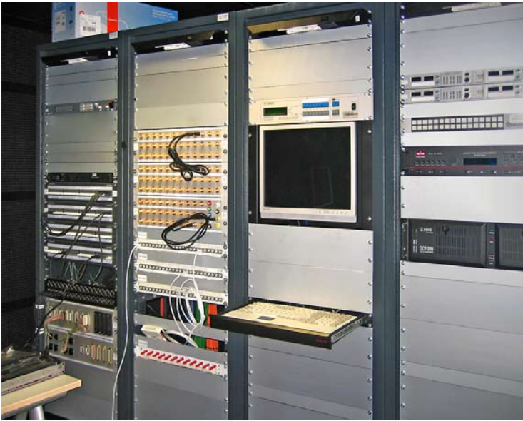
Patch fields for audio control and video data, alongside with the audio and video racks