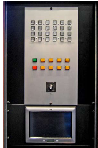
Auditorium control panel and media control

Media Technology has been installed which realistically reproduces different sound sources by means of many small speakers.