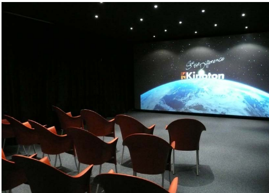
Kinosaal im Kinoton Technikzentrum

The German manufacturer of professional projection systems Kinoton GmbH has opened a new Technology Center in the vicinity of Munich. Modern technical equipment, state-of-the-art presentations technology and flexible seating enable versatile use. The new premises serve as training facilities, demo center and showroom. Besides this, they are perfectly suited for testing new projection and display technologies.