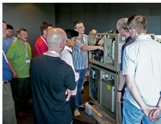
Hands-on training at a DCP Digital Cinema Projector